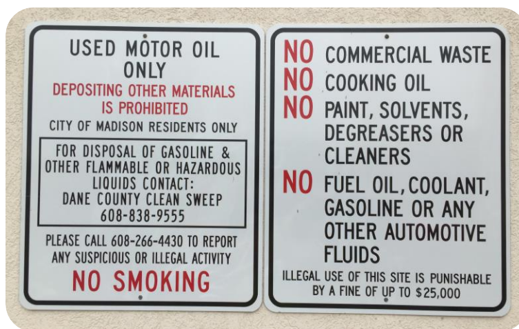
New signs posted at a city of Madison used oil collection site.

The city expects to further invest in dual-compartment tanks when they upgrade all of their public used oil drop-off sites. Once upgrades are made, city residents will be able to continue to drop off used oil when a full compartment is locked out after sampling.