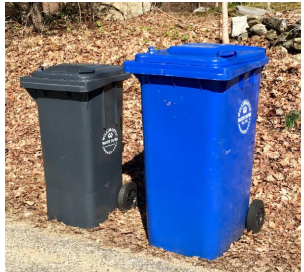
Mansfield's variable sized carts, 20 gallon trash and 65 gallon recycling