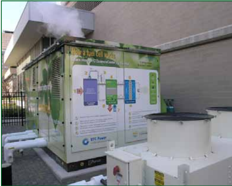
UTC Fuel Cell provides electricity for the Connecticut Science Center

Two Connecticut companies – FuelCell Energy and UTC Power – are world leaders in the production of power with the use of fuel cells. Both produce stationary fuel cells that provide reliable power 24 hours a day, with high efficiency and virtually no pollution. Unlike more traditional power sources that use fossil fuels less efficiently, the by-products from an operating fuel cell are heat and water with next to no pollutants and minimal carbon emissions.