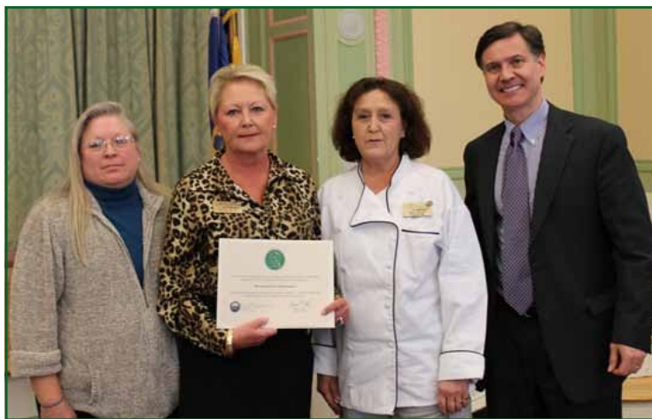
Staff from The Orchards receive a Green Circle Award from DEEP Commissioner Dan Esty.

How low can the VOCs go? Concern over the effects of cleaning products used around residents and staff, especially those with respiratory conditions, resulted in eliminating products that contain VOCs or hazardous chemicals; only Green Seal certified and Design for the Environment (DfE) cleaners and disinfectants are now being used. Carpets are cleaned without water or shampoo, using a system called HOST® Dry Extraction Carpet Cleaning System. Most times, all that's used on table tops, floors and the grill is a solution of white vinegar and water. The paint, carpeting and vinyl flooring used in the building and residents' apartments are low/no VOC.