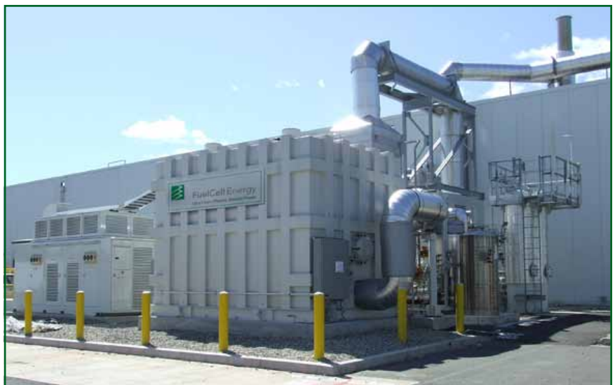
A FuelCell Energy installation at a commercial bakery in Bloomfield.

UTC Power is currently staffed with about 430 people. The company continuously seeks exceptional talent to advance its technology and maintain Connecticut's leadership in the fuel cell industry. For more information on these companies, go to www.fuelcellenergy.com and www.utcpower.com .