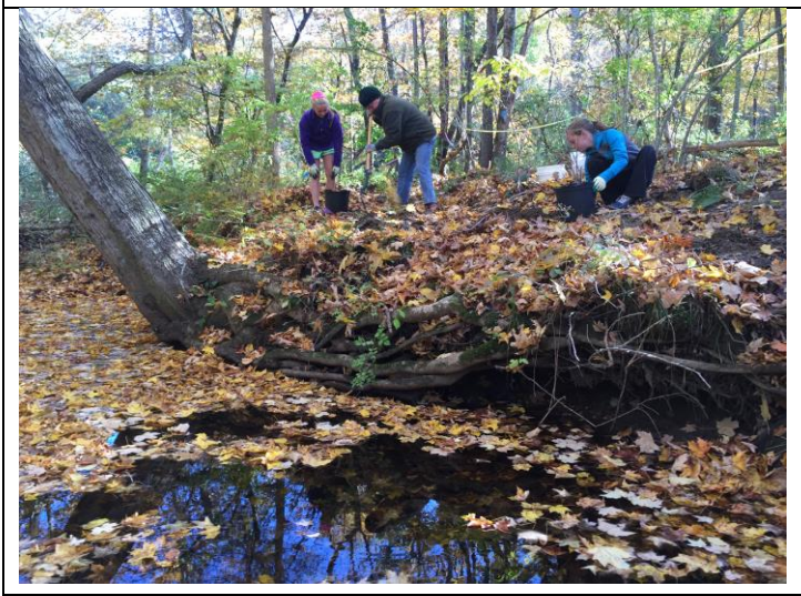
TU volunteers and students work together to revegetate areas along the old trail that followed the top of the stream (2015).