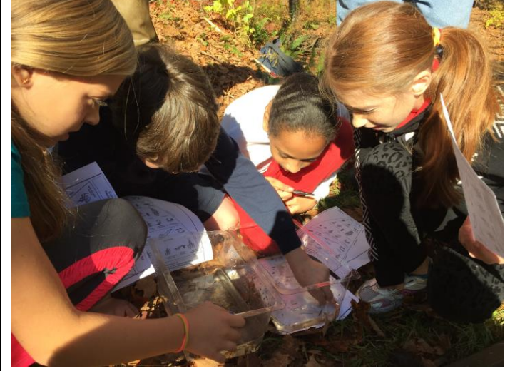
Students from the Booth Elementary school in Roxbury, CT identify macroinvertebrates collected during the Jacks Brook