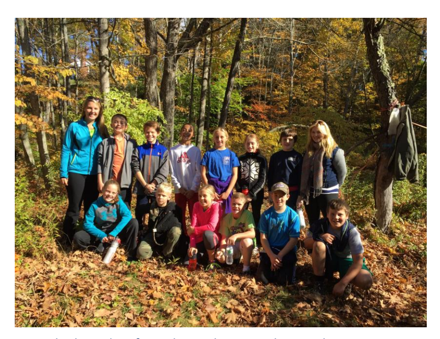
Local 5th graders from the Roxbury Booth Free Elementary School after planting 82 plants along Jacks Brook at the Brian Tierney Preserve in Roxbury, CT (2015).

The TU Naugatuck Chapter of CT began planning for the Jacks Brook Project in early spring 2015. Several site visits were conducted to determine the best location for improvement work. A proposal from the chapter was submitted in 2007 and approved by the CT Trustees for the GE Natural Resource Damages Fund. The previous proposal outlines several large wood installation projects. Since personnel and resources have changed within the Chapter, it was determined that the best way to improve habitat in Jacks Brook was to relocate the existing preserve trail away from the steep banks and to plant the area with native shrubs and trees. Two volunteer work days were organized to complete the invasive species control and prepare the planting area. On October 16<sup>th</sup>, 2015 twelve 5<sup>th</sup> graders from the local elementary school and their teachers