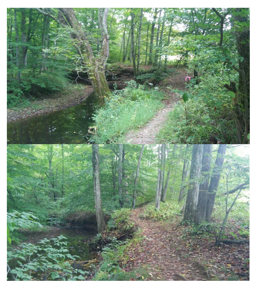
Photo Monitoring Station 1: Looking upstream at Preserve trail that was constructed on the top of the stream bank (Summer 2015 Photo TU).

Photo Monitoring Station 2: Looking upstream at Preserve trail that was constructed on the top of the stream bank. The stream bank is steep and eroding in this location (Summer 2015 Photo TU).