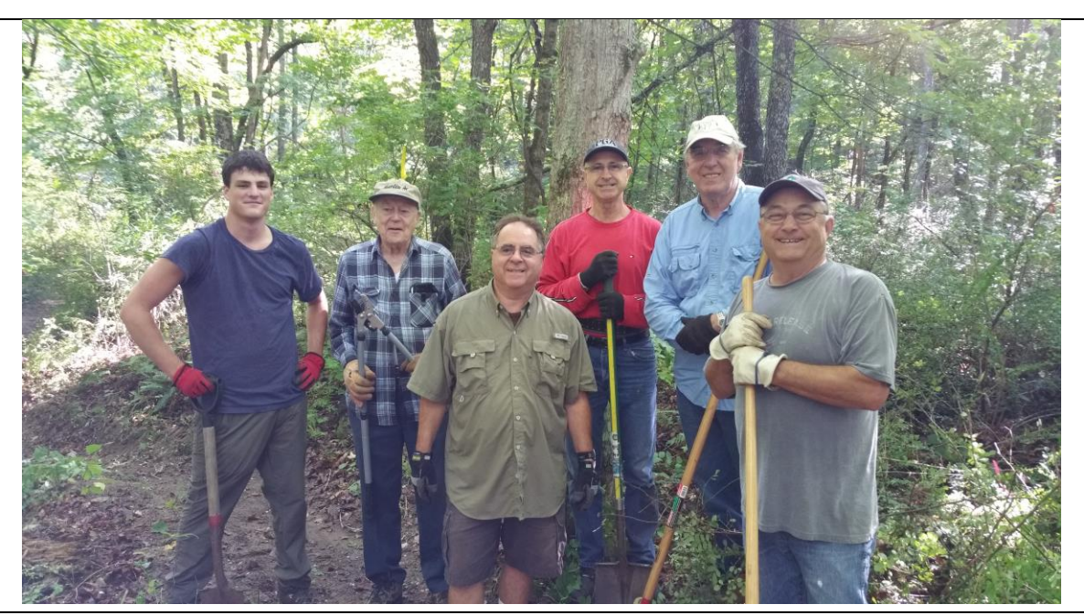
TU volunteers after a morning of invasive species removal (2015).