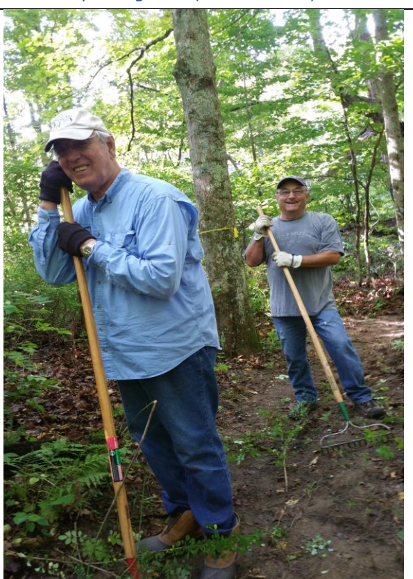
TU volunteers clear invasive barberry and multiflora rose along stream bank in preparation for planting with local students (2015 Photo TU).

the Jacks Brook planting event (2015 Photo TU)