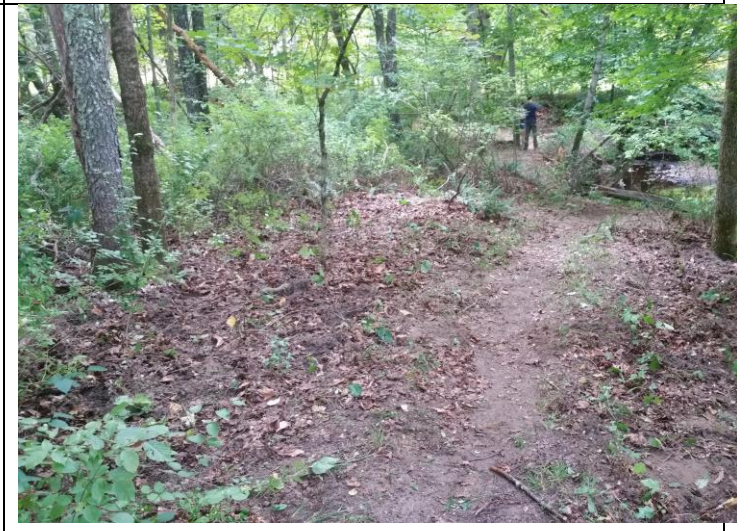
Working closely with Preserve manager several areas were cleared of invasive species and the old trail was located away from the steep stream bank (2015).