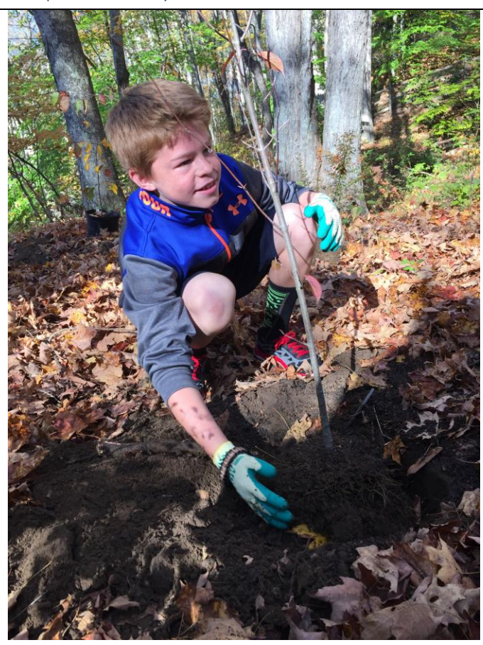
Students helped install plants from Earth Tones Native plant nursery in Woodbury, CT (2015).