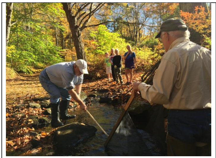
TU members demonstrate macroinvertebrate sampling during